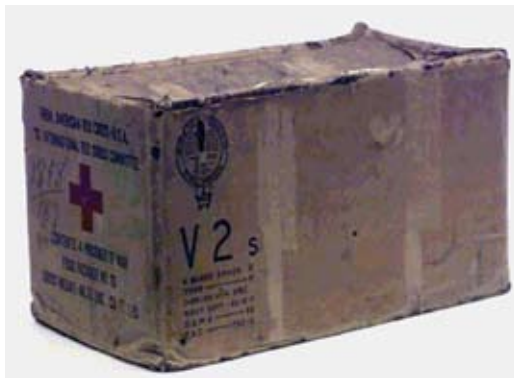
Figure 1: A Red Cross parcel was used as a currency through the camp.