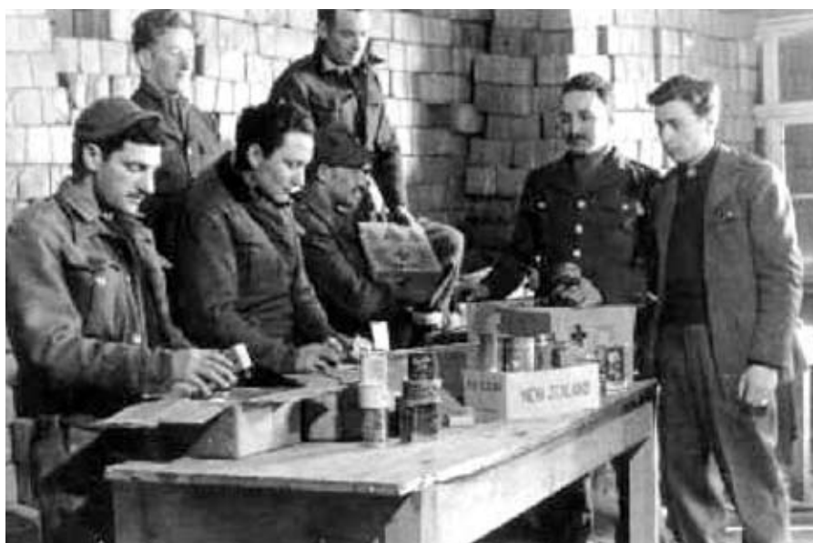
Figure 4: POWs collected and administered Red Cross parcels, hoarding rations for the escape

Breakfast rations consisted of ersatz coffee made from acorns and dry black bread. Sauerkraut soup and a portion of mouldy potatoes followed for lunch, and dinner was some sausage or a peculiar cheese made from fish by-products.