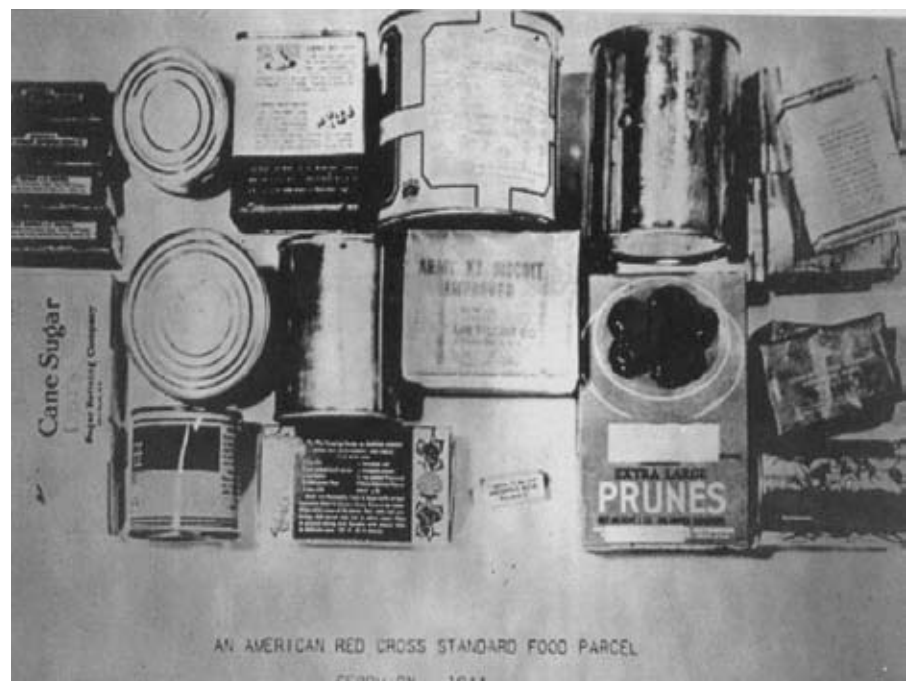
Figure 2: Typical foodstuffs that were found in a Red Cross parcel

These packages not only supplemented meagre camp food but also were essential to both the escape and post-escape survival outside the camp, which required survival rations for up to several weeks. Camp rations ran at 800 calories per day. This was far less than the optimum 1,200–1,600 calories recommended for a normal healthy adult.